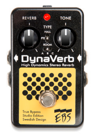
EBS DynaVerb Studio Edition provides eight different true stereo digital reverb effects, from rooms to plates and halls. All in a compact pedal.