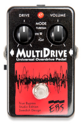
EBS MultiDrive Studio Edition is a 'class A' overdrive pedal, capable of producing sustain, overdrive and many other useful 'tube amp' distortion sounds.

EBS UniChorus Studio Edition let you choose between low noise studio quality chorus, flanger and pitch modulation effects.