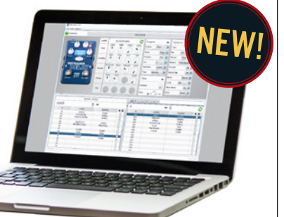
Now featuring a desktop editor for MacOS and Windows. Free download from ebssweden.com