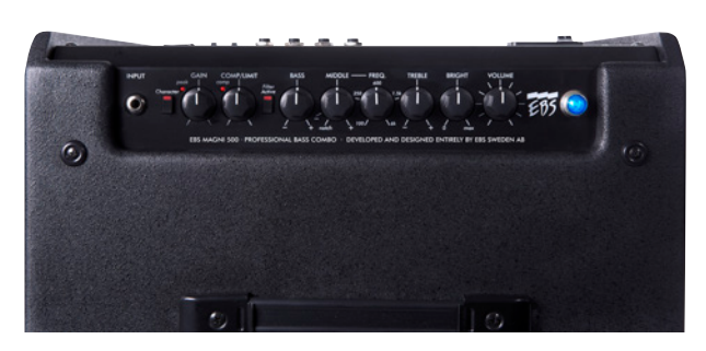
MAGNI 500 - CONTROL PANEL

The Magni is available in two models – a 2x10'' + tweeter and a 1x15'' + tweeter configuration – to serve your taste.